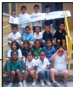
Oaklawn Students Show Appreciation!

Thanks to this donation, students at Oaklawn and Worth Heights Elementary Schools now have additional support for student success. School staff will be able to ensure that students in need have access to school supplies and uniforms.