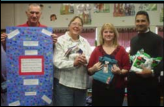
De Zavala Gives SERTOMA a Thumbs UP!

The Service to Mankind (SERTOMA) organization sponsored a Shoes for Schools program at De Zavala