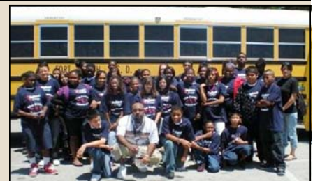
Meadowbrook Middle School 7th Grade Students

The Fort Worth Chamber of Commerce East Area Council and Texas Wesleyan University hosted Meadowbrook Middle School seventh graders for the third annual Math & Science Camp. Students jumped into hands-on learning about math, science, and team building and personal growth.