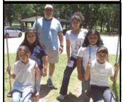
Pen Pals Connect

Texas Young Lawyers Association, these classes provide tools to make positive choices in areas of bullying, teasing, and drug use.