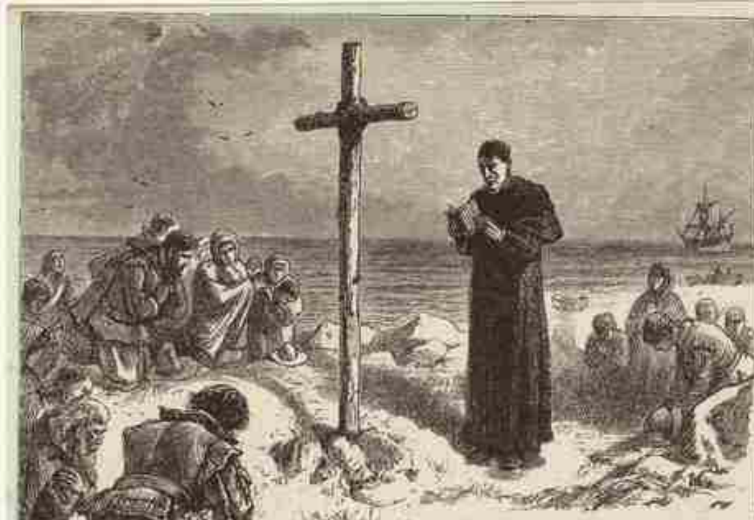
Landing of the Colony

of flood tide. The first of these, long since reduced to a long, low sandspit, hardly discernible above the water, the voyagers named St. Clements, and chose as their first landing-place on Maryland soil. It had then a sloping shore, and cedars, nut-trees, sassifras, with