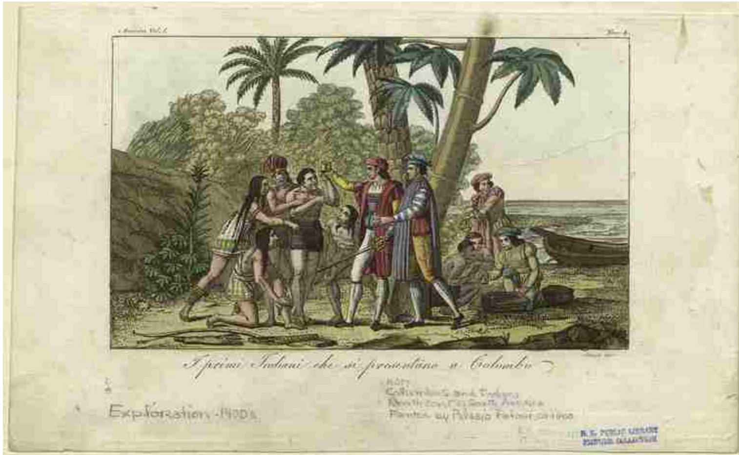
Species Indiarum in praesentia a Colombo