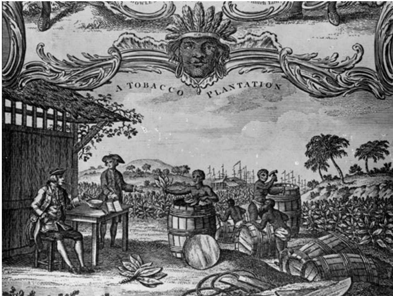
Transparency 2 – Jamestown Tobacco Plantation