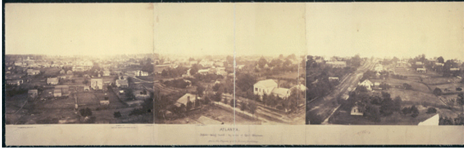
LOC digital Image