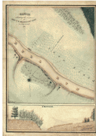
LOC digital Image

The Battle of Bull Run is the first major battle of the Civil War.